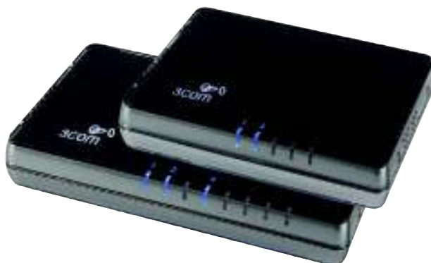
from top: 3Com Switch 5, Switch 8

Operating system independence. Supports maximum integration of different operating systems within a network—no extra configuration of the network is required.