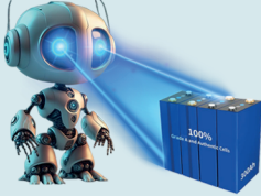
Smart Cell Monitoring