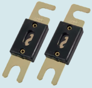
Built in Fuse Protection