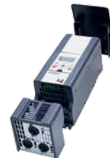
IP21 / NEMA1 Kit