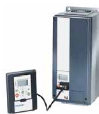
Keypad Door Mounting Kit