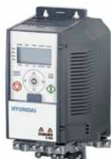
Option Board Mounting Kit