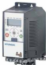
Option Board Mounting Kit