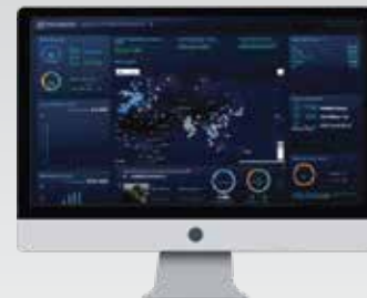
Smart PV Monitoring Platform