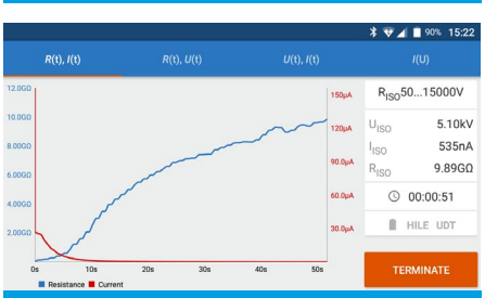
Supported by a mobile application