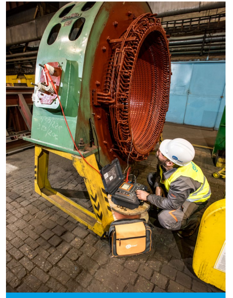
Professional diagnostic tool